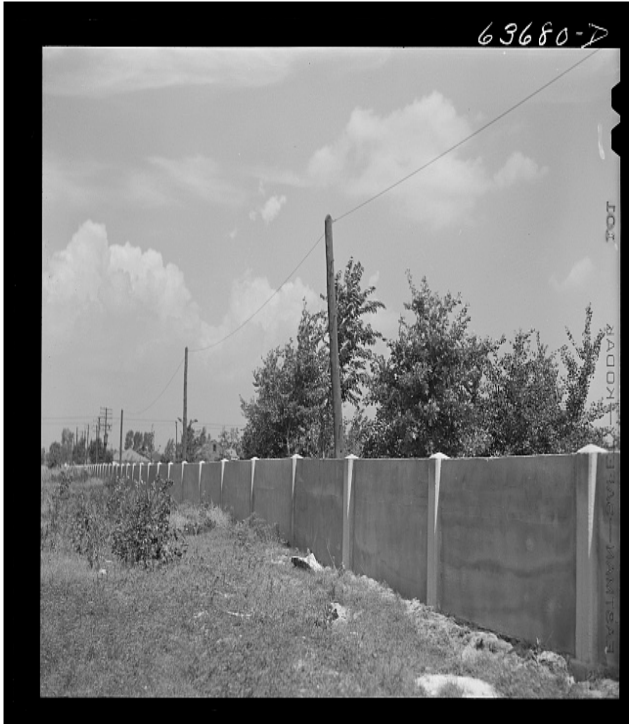
Concrete wall separating Eight Mile-Wyoming from surrounding white suburbs.